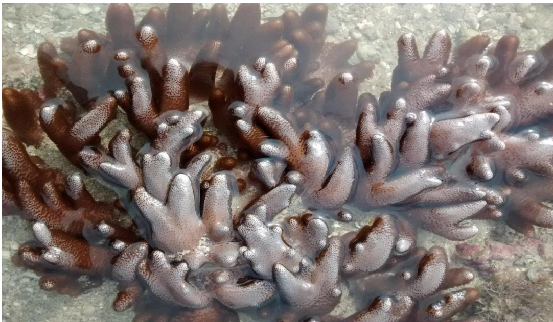
Figure-2 soft coral colony, sinulariapolydactyla recolonized on the Chandri reef