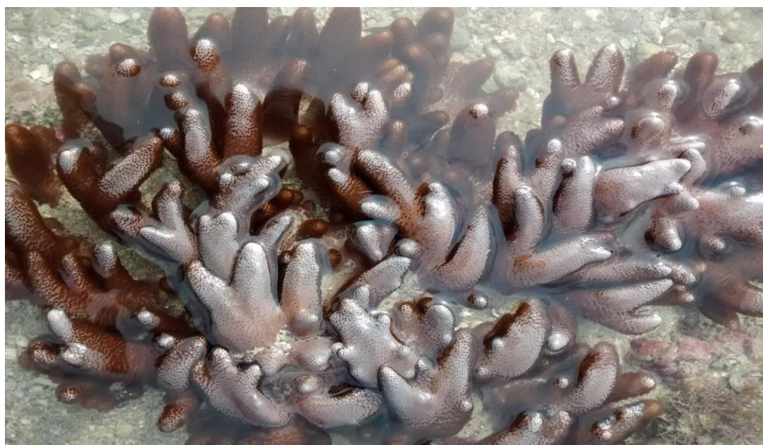
Figure-2 soft coral colony, sinularia polydactyla recolonized on the Chandri reef