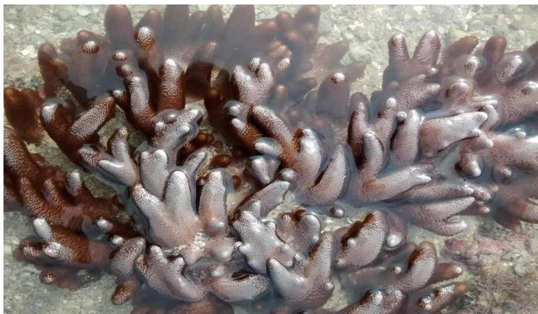
Figure-2 soft coral colony, sinulariapolydactyla recolonized on the Chandri reef