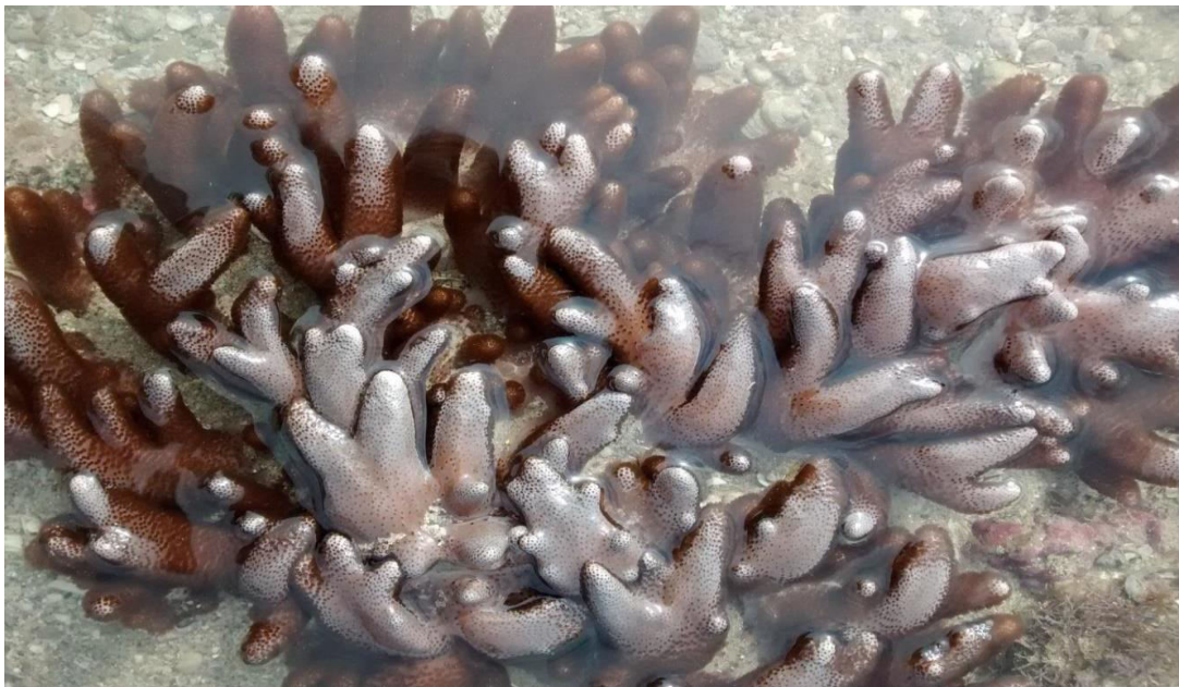
Figure-2 soft coral colony, sinulariapolydactyla recolonized on the Chandri reef